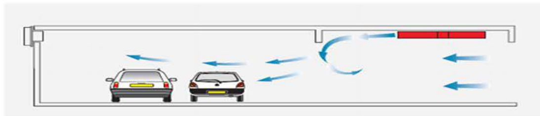
Air turbulence is dramatically reduced when using a RCS Induction CPV fan